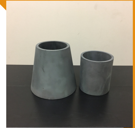
Original size liners available in most sizes.