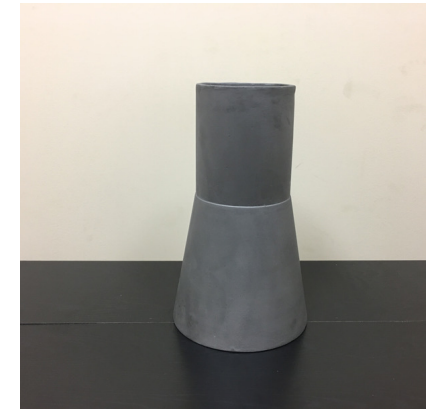
Our custom one piece Lower Cone and Apex Liner has proven to be very successful.