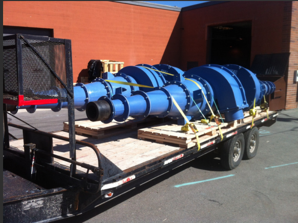
Some of Our completed Cyclones

See inside panel for one of our customers testimonial.