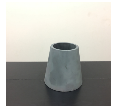
Middle Cone Liner